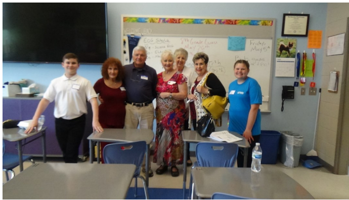
(DWTD continued from page 1)